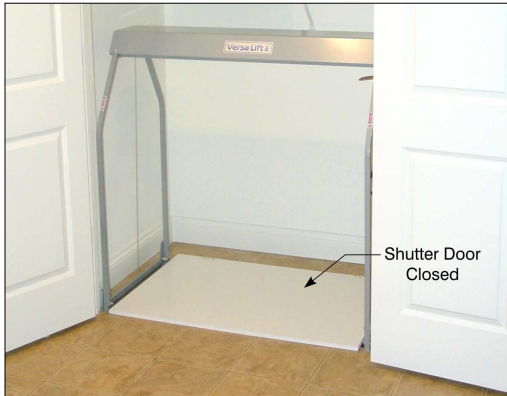
Shutter Door Closed

The Auto-Shutter automatically deploys a shutter door to cover the Versa Lift opening whenever the lifting platform is lowered. This accessory is required whenever the Versa Lift is installed inside the living space of a home, or in a closet, or in an attic space accessible by a passage door from a living space, or on a deck, or any other area where children or pets might have ready access to the lift opening. Kit includes all parts and hardware needed and detailed instructions for installation.